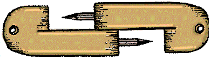
Version A open