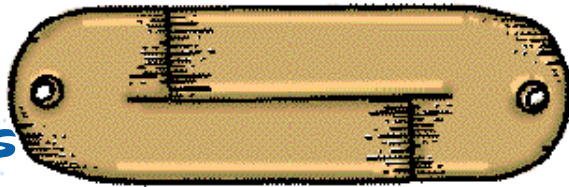
Version A closed

Trace the pattern on the wood and using the saw, cut out the two pieces. Note: If a coping or jig saw is unavailable, the awls can be made just by cutting the piece in half. Using the 3/16-inch bit, drill one hole at the end of each piece. On the end of each piece drill the following holes: One the same diameter as the nail, the other slightly smaller. The hole that is the same diameter serves as a "sheath" for the nail. The other is a pilot hole to prevent the wood from splitting. Make sure that the pilot hole on one side lines up with the sheath hole on the other piece. Drive the nail into the pilot hole on each piece leaving at least 1 1/2 inches of the nail exposed. Using the cutters or hacksaw, cut off the head of the nail. File or grind the head of the nail to a point. Put nylon line through the hole at the end of each piece. Knot the line so that it won't pass back through. Repeat on the other end. Assemble the two pieces and wear the awl around the neck when on the ice. □